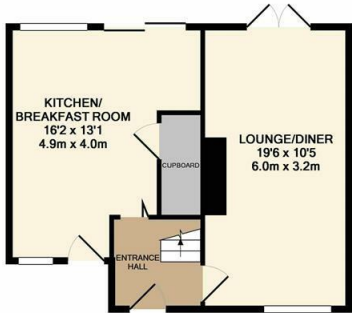
GROUND FLOOR APPROX. FLOOR AREA 426 SQ.FT. (39.6 SQ.M.)